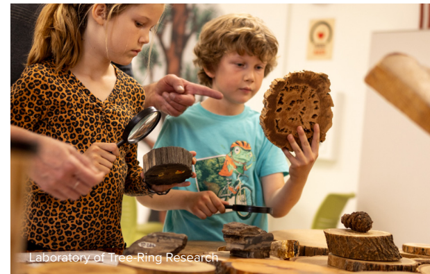
Laboratory of Tree-Ring Research