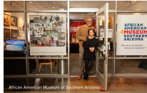
African American Museum of Southern Arizona