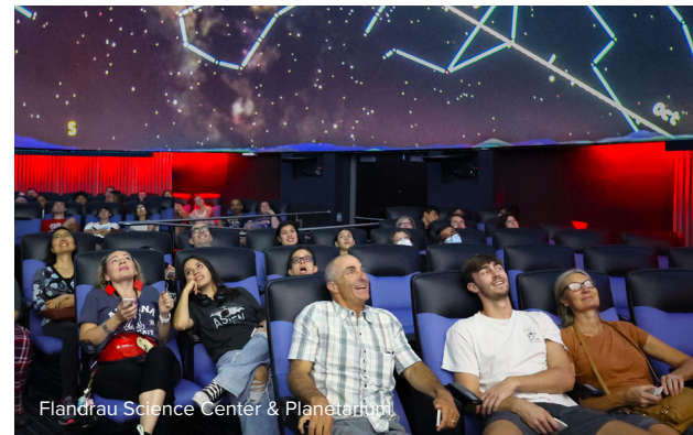
Flandrau Science Center & Planetarium

Immerse yourself in a day filled with discovery and wonder, where you can visit twelve unique museums and collections, bridging the arts and science. Visit research.arizona.edu to plan your experience or try our sample tour plans below.