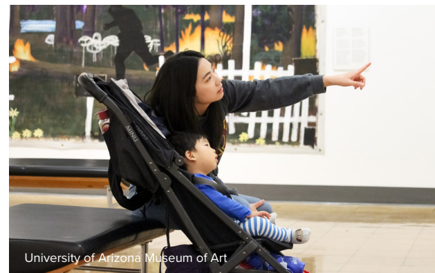
University of Arizona Museum of Art